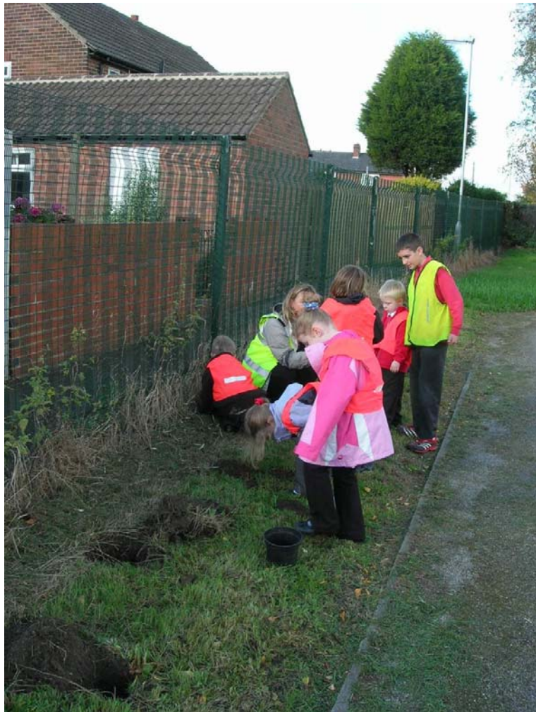
Photograph 4 Pupils from Woodlesford Primary School planting bulbs at Rothwell day centre

A spring bulb planting day at Rothwell Adult Learning Centre with pupils from Woodlesford Primary School and users from the centre. The work has continued at the centre with a Groundwork youth worker working alongside Woodlesford in Bloom staff to maintain the raised planters. This relationship has continued after the completion of the project funding period with an action day taking place 08/02/08 to continue the work in the grounds.