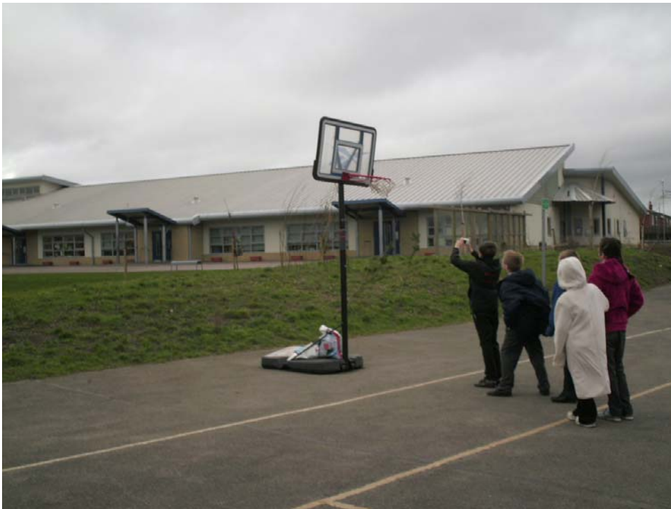
Photograph 2 Rothwell Primary School pupils taking pictures of their likes and dislikes in the school grounds

Pupil's ideas were used to inform a school grounds development report which was presented to the headteachers. Subsequent to our work in Rothwell C of E Primary School, the school has received an RBS Supergrounds grant for the development of its school grounds. The school used the consultation work produced by pupils as part of the ReCreate project to support their application.