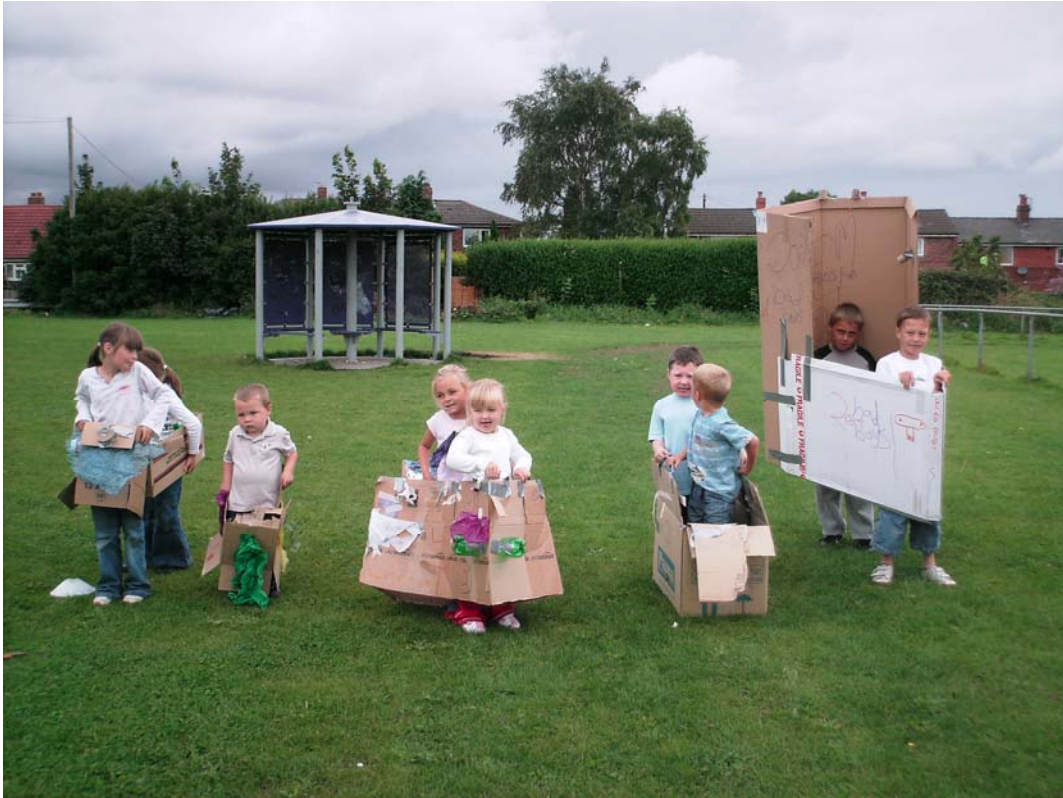
Photograph 5 Playscheme at Rose Lund Centre recycled boat race

Playscheme sessions focused upon the use of the outdoor environment were developed, designed and run for children attending the Rose Lund Centre. Children hunted for minibeasts, engaged in arts and craft activities, played team games and even built their own boats out of reclaimed materials..