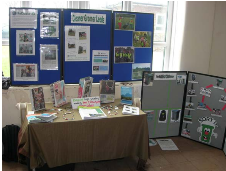
Photograph 3 Display of work at Blackgates Primary School community day

develop their findings into areas for change, these ideas were displayed at a community day held at Blackgates Primary School with Groundwork staff running activities on the day. The community day was also supported by the ReCreate project working with pupils to create recycled fashion with pupils putting on a fashion show.